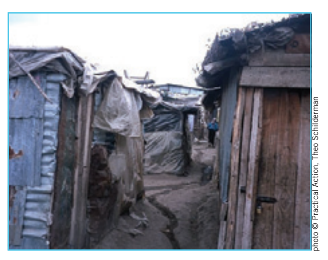
Slum in Mavoko, 30 Km to the East of Nairobi, Kenya, with houses built of waste materials, and hardly any infrastructure

Post-disaster reconstruction in urban areas has proven to be particularly challenging because communities are less stable; people have lost traditional skills or access to traditional resources and they often lack secure tenure and face a multitude of regulations. Many of these challenges have been overcome in normal urban housing or upgrading projects and programmes, from which