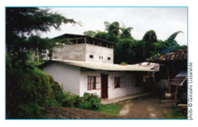
In this reconstruction project in Colombia, money was made available to rebuild livelihood infrastructure (in this case for coffee processing, the elevated part) as well as housing

What are the handbooks, and how does this Toolkit relate to them?