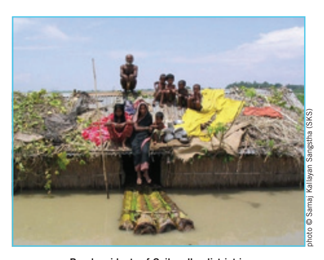
Rural residents of Gaibandha district in Northern Bangladesh get flooded every few years

In between the occasional large-scale disasters which get the majority of media coverage, a multitude of smaller disasters are affecting poor people worldwide on a daily basis. These however, rarely make the headlines. Such disasters attract little external help; the affected rely mostly on community resources and traditional knowledge for their recovery. Communities that are regularly